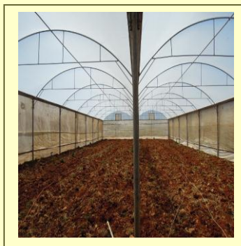
Inside view of a completed greenhouse

Once the farmer who owns the greenhouses generates enough profit to be able to pay back the loan from Center for Freedom and Justice, the money will be given to another farmer so that he too may benefit from the project.