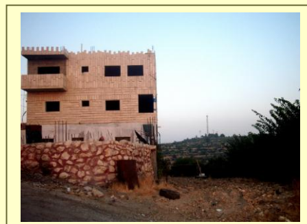
One of the condemned homes in Beit Ommar.

“Over the past six months, settlers in Karmeit Tzur have built over three hundred new houses while Palestinians are forbidden from building any new structures on their own land.”