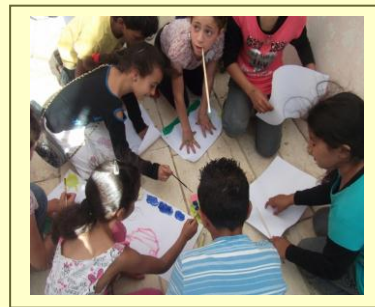
Children working on an art project during the Center's day camp

Most importantly, through its program of enriching experiences and educational opportunities, the Center for Freedom's summer camp gives Palestinian youth a chance to enjoy what the Israeli occupation has systematically denied them: the chance just to be children.