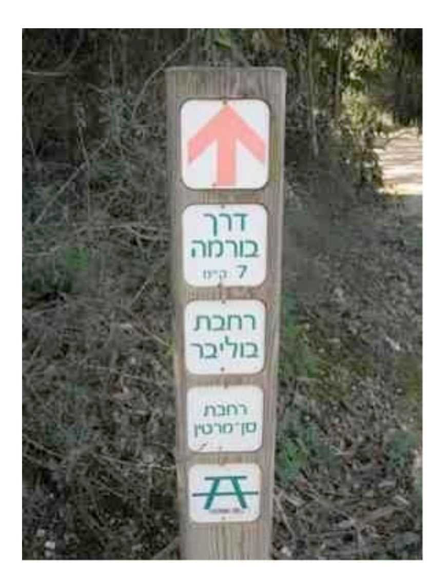
Figure 7.1 – Signpost for the Bolivar & San Martin courts in Eshta'ol Forest

San Martin; they stand on the land of Beit Mahsir. A number of other sites are reportedly named after the country of Venezuela (13).