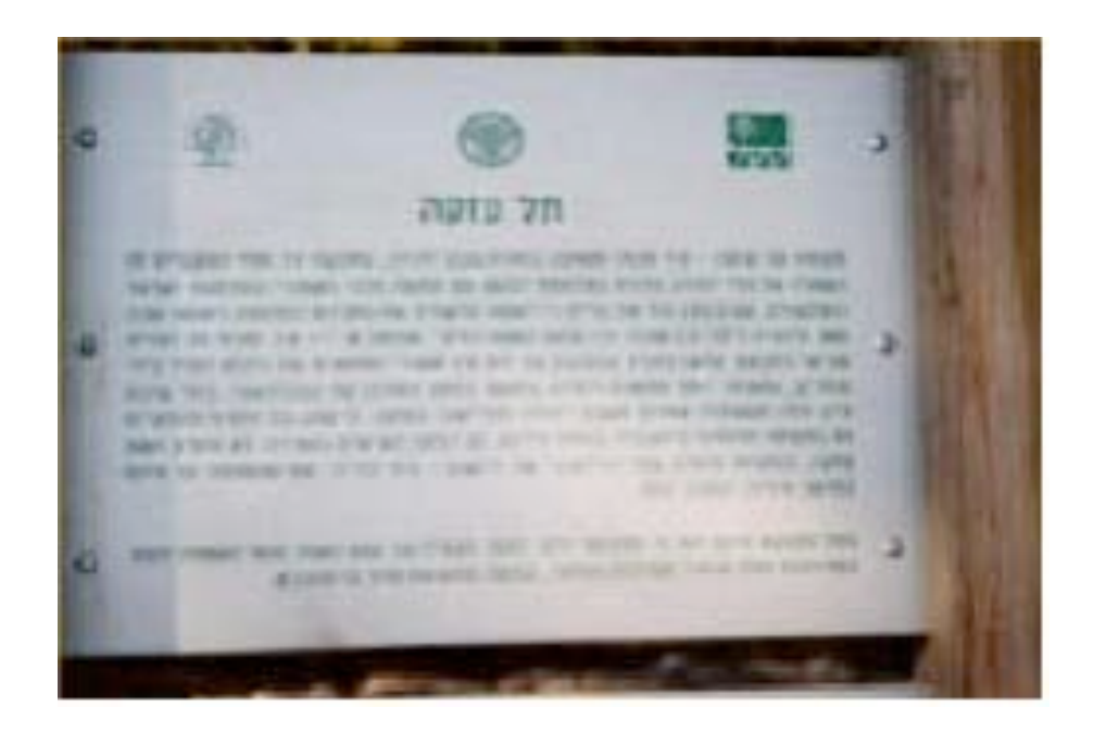
Figure 3.3 – Signpost for the ruins of Tel Azeqah in the British Park

An additional reference to the settlement of Beit Zecharia appears in the official signpost for the ruins of the fortress city of 'Tel Azeqah', decorated with three official logos – the JNF, the Antiquities Authority, and the Society for the Protection of Nature (Figure 3.3).