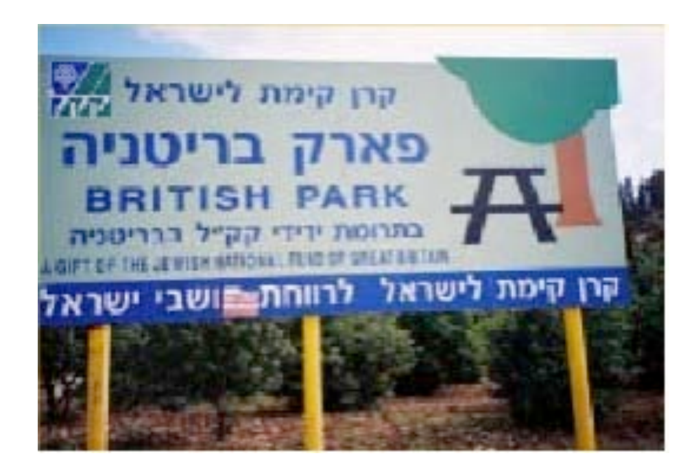
Figure 3.1 – Signpost at the entrance of the British Park

The signpost at the entrance of the British Park (see Figure 3.1) proclaims the park as "a gift of the Jewish National Fund of Great Britain".