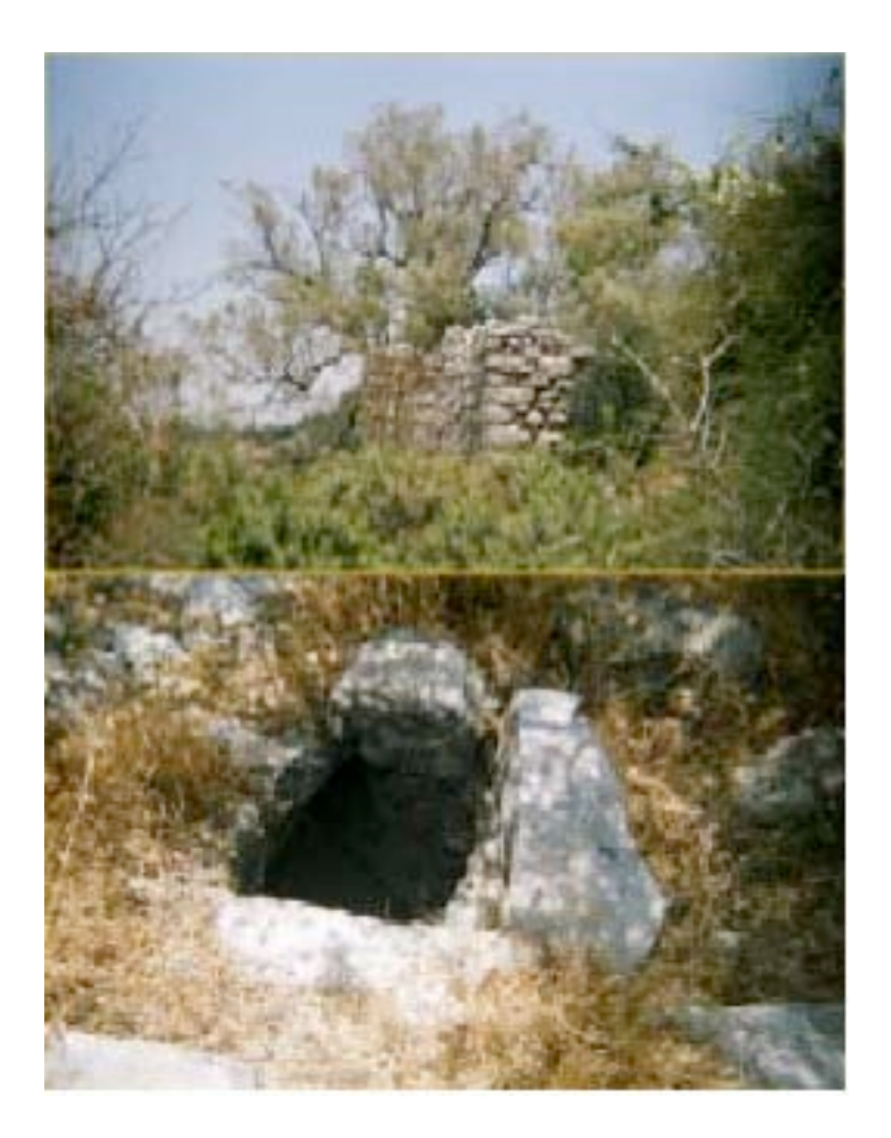
Figure 3.2 – Remains of the Palestinian village of Ajjur

Prior to the ethnic cleansing of 1948, Ajjur was one of the larger Arab rural localities in the country. Today, the indigenous Palestinian people of Ajjur are stateless refugees, living mostly outside the 1949 armistice line (the so-called Green Line) in Dheisha and Arrub refugee camps, south of Bethlehem.