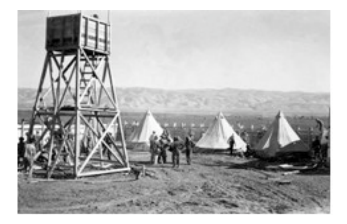
Figure 2.1 – Early Zionist watchtower