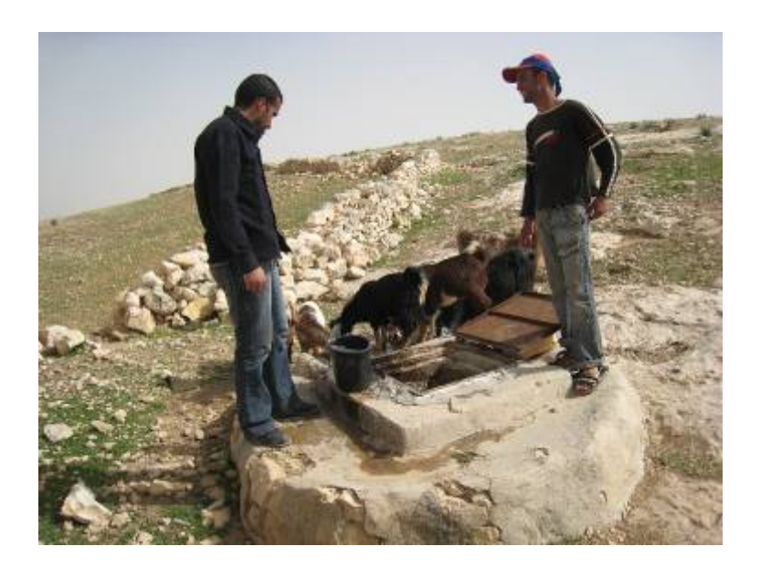
A Nabataean cistern belonging to Hathaleen shepherds in the Southern Hebron Hills

Rainwater harvesting cisterns have been used in the region for centuries. Household cisterns are mostly small, with an average capacity of 50m<sup>3</sup>. Agricultural cisterns, with a slightly larger capacity, are built in the ancient Nabataean tradition - located at the lowest point of a specially contoured area that is created with slopes and berms to increase rain run-off and collect the rainwater. The cisterns are circular or square, dug into the ground and lined with stones or concrete to prevent leakages, with an opening at the top that is kept covered to prevent evaporation and contamination. The water collected during the rainy season is stored for use in the dry season.