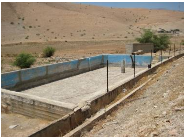
Top: Israeli settlers in Maaleh Adumim enjoy a swim. Above: An empty Palestinian agricultural reservoir near Jiftlik in the West Bank.