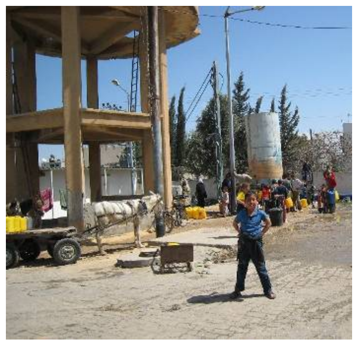
Residents filling containers of drinking water at a water purification plant in Khan Yunis, Gaza Strip

The yearly sustainable yield of the Coastal Aquifer in Gaza, some 55 MCM, falls far short of the population's needs. Israel does not allow the transfer of water from the Mountain Aquifer in the West Bank to Gaza. (In any case, such transfers would be feasible only if Israel allowed the Palestinian population of the West Bank access to a more equitable share of the Mountain Aquifer, as the current allocation is not sufficient to meet even their own needs.)