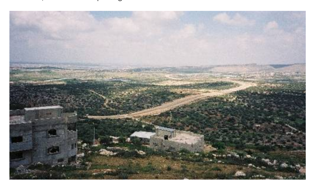
Jayyus' land with the fence/wall snaking through the landscape

An examination of the map showing the line of the fence/wall around Jayyus indicates that its route was determined with land grabbing, rather than "security" considerations, in mind. The fence/wall makes a large loop around the Israeli settlement of Tzufim, itself built on Palestinian land, incorporating an area of Palestinian land ten times the size of the settlement, with a view to expanding the settlement in the future. 110