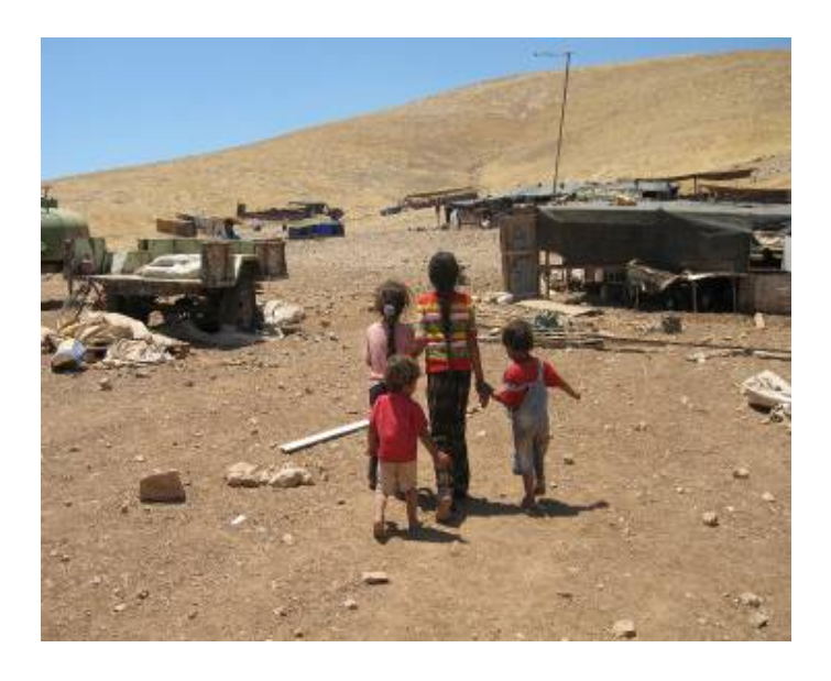
Children in Humsa © Al

In'am Bisharat, a mother of seven children who lives in Hadidiya, told Amnesty International: "We live in the harshest conditions, without water, electricity or any services. The lack of water is the biggest problem. The men spend most of the day going to get water and they can't always bring it. But we have no choice. We need a little bit of water to survive and to keep the sheep alive. Without water there is no life. The [Israeli] army has cut us off from everywhere. The roads are closed. The road to Tammun, where the children go to school, is only opened three days a week (Sunday, Tuesday and Thursday) and only for half an hour in the morning and half an hour in the afternoon (8 to 8.30am, and 3 to 3.30pm). So the children have to stay in Tammun with our relatives during the week. We don't choose to live like this; we would also like to have beautiful homes and gardens and farms, but these privileges are only for the Israeli settlers and we are not even allowed basic services."