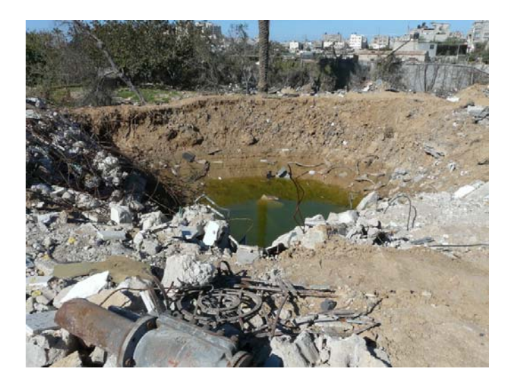
Sewage mains in northern Gaza destroyed by Israeli air strikes in December 2008/January 2009

Israeli forces have also damaged water facilities when demolishing Palestinian houses and property, often using D9 armoured bulldozers to dig up roads and rip through water and sewage pipes. These bulldozers have claw-like rippers which are attached at the rear and thus not of use in detecting or protecting the bulldozer operators against hidden explosive devices. These are used to dig up the road or terrain behind the bulldozers as they drive forward and are clearly intended to cause serious damage to roads and anything else in the bulldozers' wake.