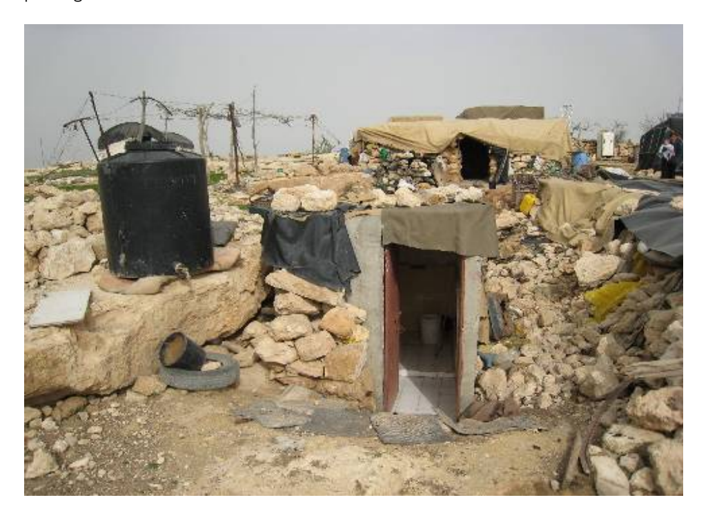
Susya toilet under demolition order by the Israeli army

On 3 July 2001, the Israeli army destroyed dozens of homes and water facilities in Susya and several other Palestinian villages nearby. The army smashed the villagers' rainwater harvesting cisterns, some of them centuries old, with bulldozers and filled them with gravel and cement to prevent their repair. The soldiers also smashed water heating solar panels that had been provided to the villagers by a non-governmental organization. Some water cisterns were left undestroyed but they, together with the tents and shacks that now serve as the villagers' homes, and even the one toilet which they have built, all have demolition orders pending.