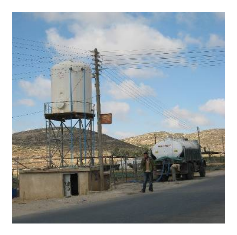
A water tanker at a filling point in Rihiyeh, in the southern West Bank @ Al

the water has to be delivered by a smaller tanker or by small tankers attached to tractors. This requires more trips and each trip is several times longer than it would be if the roads were open. So, we spend more time and consume more fuel. As well, the vehicles break down all the time because of the bad roads and often the army sets up flying checkpoints and these cause further delays.