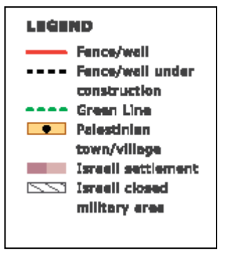
Map 2: West Bank - Palestinian towns and villages; Israeli settlements; and the route of the Israeli fence/wall

709km-fence/wall, 80 per cent of it on Palestinian land inside the West Bank