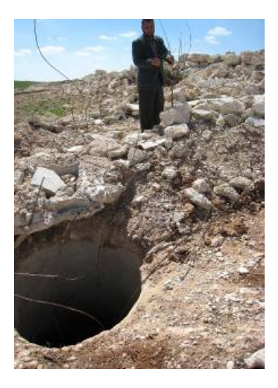
Destroyed cisterns and orchards in Beit Ula © Al

An Amnesty International delegate who visited the area on 15 March 2008 found that everything had been destroyed – apart, that is, from a plaque on which it was written: "European Union - Palestinian Agricultural Relief Committees - Project 2005/106-391." The cisterns had been systematically smashed and with the exception of a few saplings the orchard trees had been uprooted and destroyed. Bulldozers had been used to churn up the land, the fencing around the fields had been torn down and even old olive trees, planted many years before, had been uprooted and crushed. It was a scene of devastation.