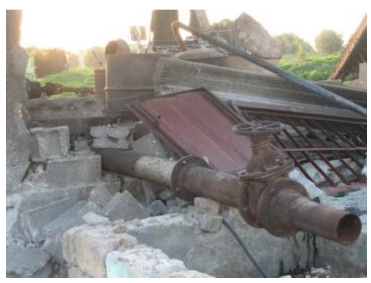
A water pump and well in the Zaytoun neighbourhood of Gaza City destroyed in an Israeli attack in January 2009

additional water locally.<sup>71</sup> Consequently, the only way to try and meet the population's water needs has been through over-extraction from the aquifer at a rate more than double its sustainable yearly recharge. Unsurprisingly, this has caused rapid deterioration of the aquifer, increasing its salinity and making it ever more vulnerable to contamination from sewage infiltration.