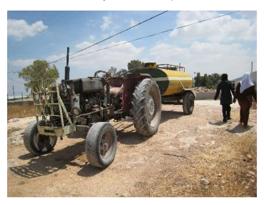
A tractor used to pull a water tanker in al-'Aqaba village in the West Bank

Iman Jabar, a resident of al-'Aqaba village, whose home has a demolition order pending against it, told Amnesty International, "There is no water in the village, so we have to bring it from far away and it's expensive. I have nine children (five girls and four boys aged from five to 19 years). We spend a lot of money on water and we have to make do with very little, just for drinking and cooking and don't have enough for the other needs. We need more water for washing, washing the clothes and cleaning the house. I can't wash and clean as often as needed. We can't afford it. It's a daily struggle. The goats also need to drink. We can't keep more goats because we can't afford the water, and we can't grow food for us and fodder for the animals, so we have to buy it and this too is expensive."