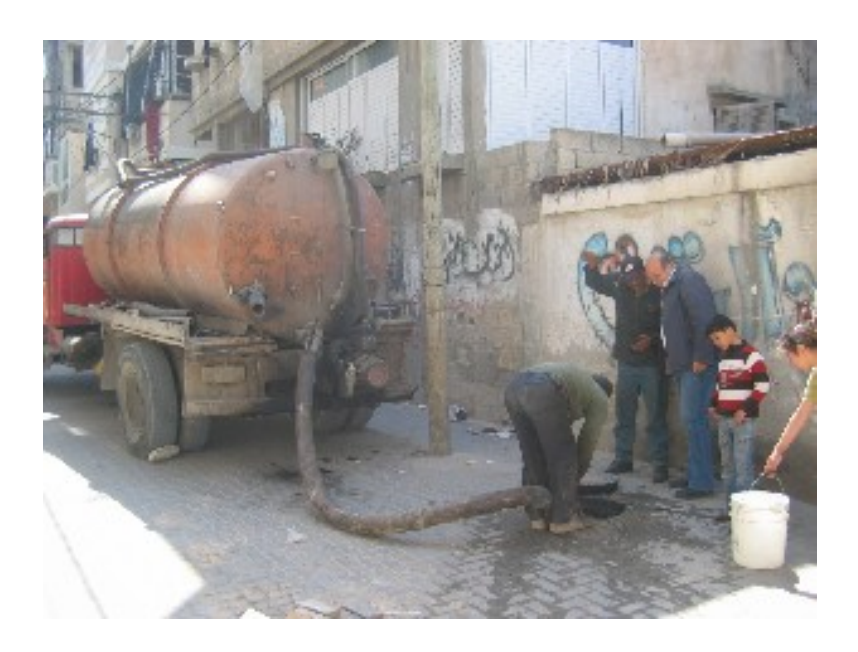
Cesspit being emptied in Gaza @ Al

The pollution of the Mountain Aquifer is a subject of contention with the Israeli and Palestinian sides each accusing the other of causing it. In practice, both sides have failed to comply with their obligations and they have both failed to take adequate measures to stop and reverse the damage.