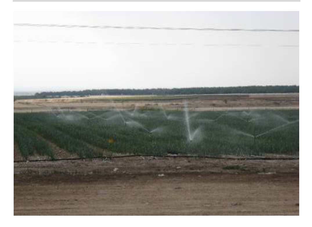
Sprinklers in Israeli settlement farms in the Jordan Valley, West Bank

The nearby Israeli settlement of Shadmot Mechola advertises on its website: "Breathtaking tours to Amaryllis bulbs hot houses which are harvested, packed and shipped to Europe and USA and potted in time to bloom during the winter holiday season. Short tours of our "Hi-tec" dairy farm, vineyards and orchards. Tours of farms in the Jordan Valley who specialize in crops of vegetables, fruits, flowers and spices for export in hot dry climate." 9