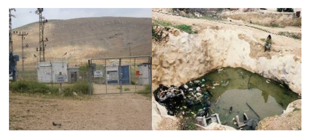
Left: An Israeli well in the OPT Right: A rainwater cistern destroyed by the Israeli army for lack of permit

The Israeli authorities, meanwhile, not only determine the quantity of water that the Palestinians are allowed to extract from the Mountain Aquifer but also monitor and enforce Palestinian compliance and control even the small quantities of rainwater that Palestinian villagers collect to augment the inadequate supplies available to them. The Israeli army frequently destroys small rainwater harvesting cisterns built by Palestinian communities who have no access to running water.